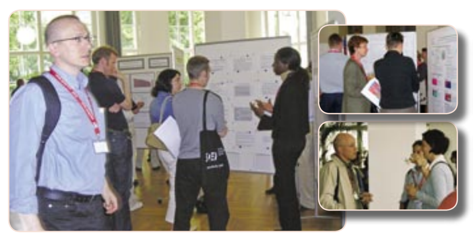
The Poster Session (above and top left) Relaxing at the reception (inset bottom and below)